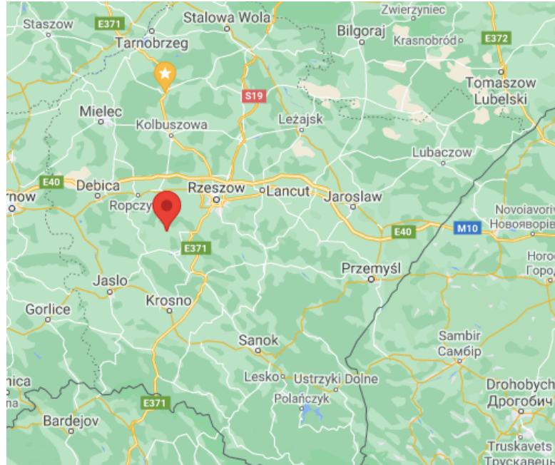
Location of Pstrągowa, just southwest of Podkarpackie’s regional capital, Rzeszów.